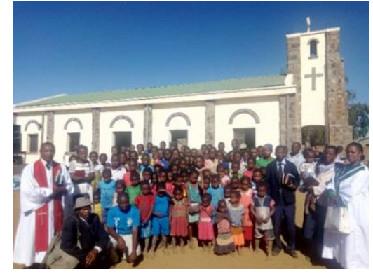
Village of Rehovotsy Christian